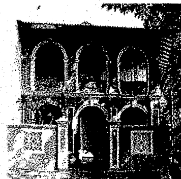
Singapore Toy Museum